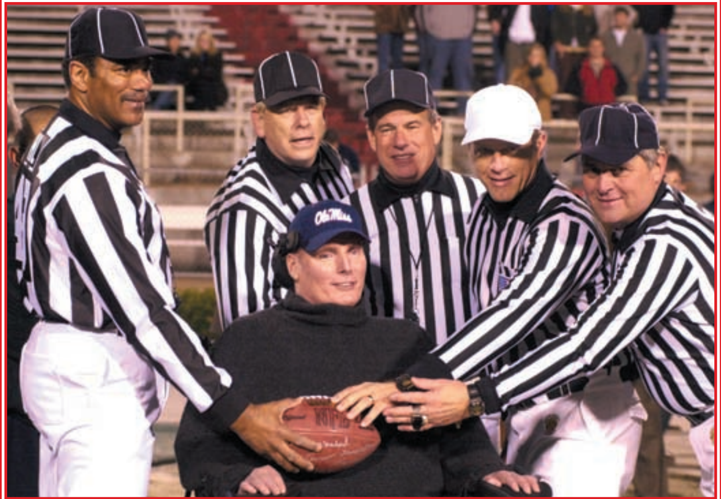
Christopher Reeve joins the men of the Epsilon Xi Chapter at Ole Miss for the Charity Bowl